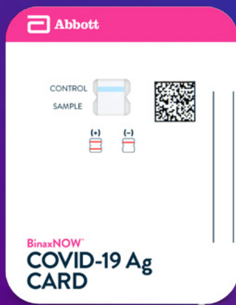
COVID-19 TEST NAVICA MOBILE APP